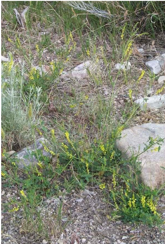
Yellow sweetclover.

Contributed by: Idaho NRCS State Office and Aberdeen, ID Plant Materials Center