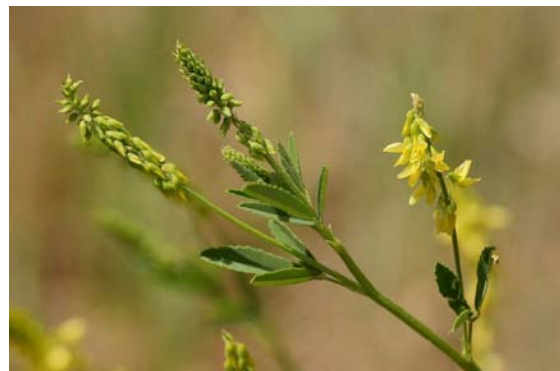
Sweetclover flower.